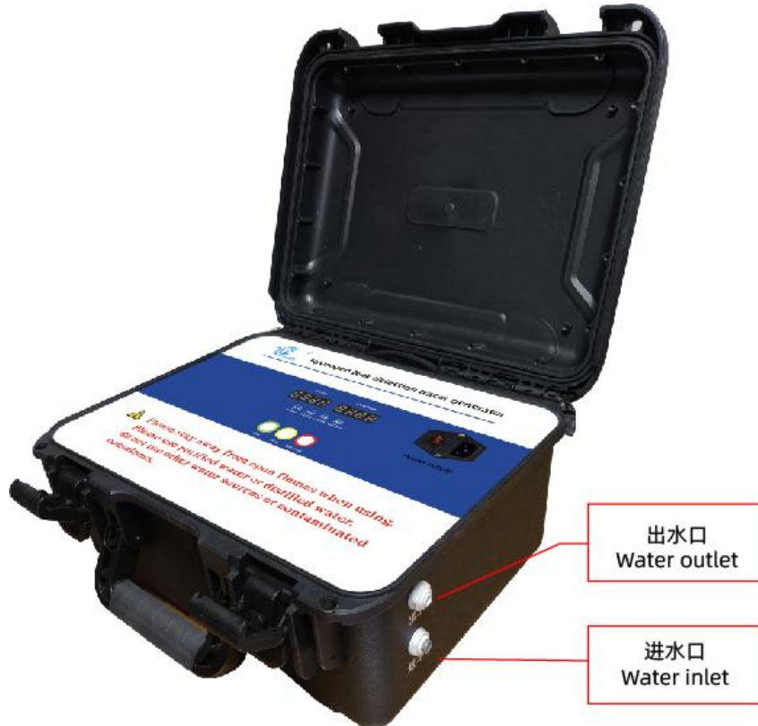
Figure 2.5 Main Interface