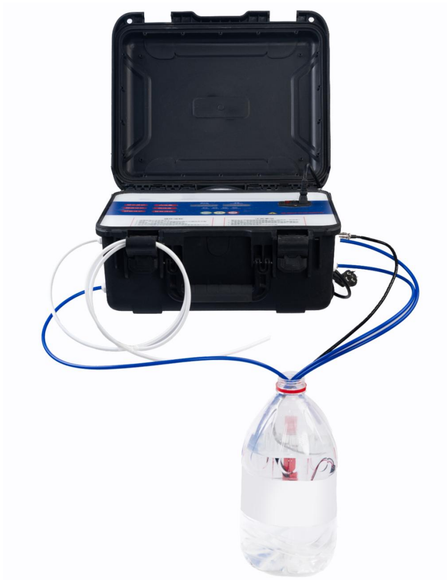
Figure 2.6 Installation and connection of the hydrogen gas generator

When connection, the hydrogen generator is shown in Figure 2.6.