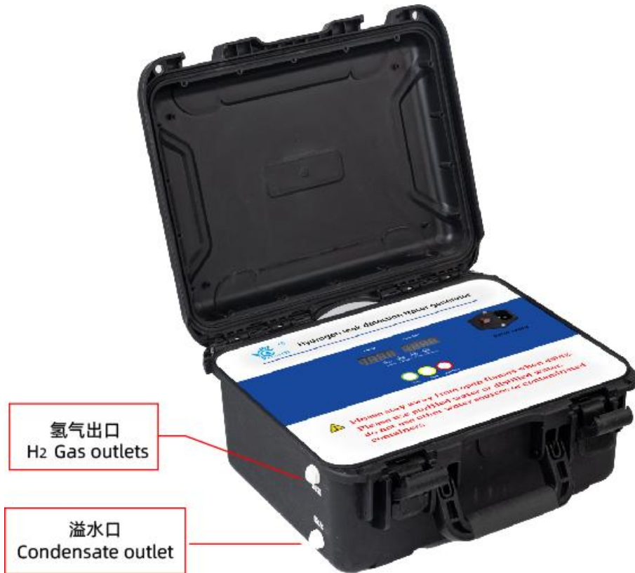
Figure 2.4 Main interface